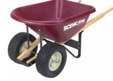
Model: M6-2T | Capacity: 6 cu.ft.