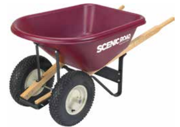
Model: M6-2K | Capacity: 6 cu.ft.