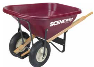
Model: M8-2R | Capacity: 8 cu.ft.