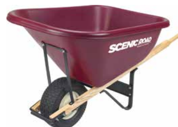
Model: M10-1T | Capacity: 10 cu.ft.