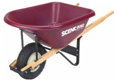
Model: M6-1K | Capacity: 6 cu.ft.