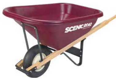
Model: M8-1R | Capacity: 8 cu.ft.