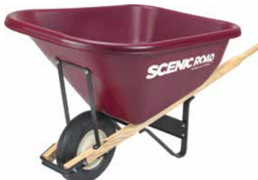
Model: M10-1R | Capacity: 10 cu.ft.