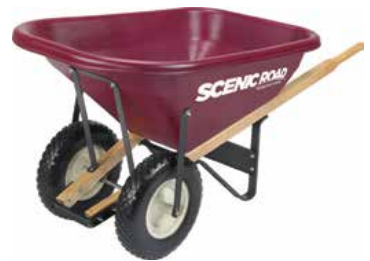
Model: M8-2FF | Capacity: 8 cu.ft.