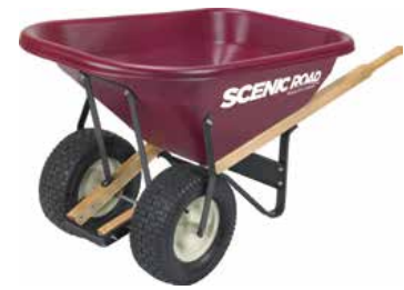
Model: M8-2T | Capacity: 8 cu.ft.