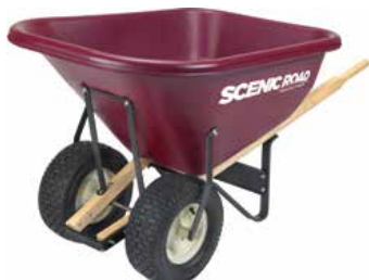
Model: M10-2T | Capacity: 10 cu.ft.