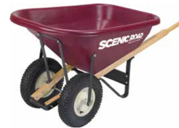
Model: M8-2K | Capacity: 8 cu.ft.