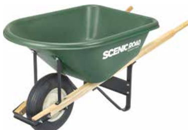
Model: G6-1R | Capacity: 6 cu.ft.