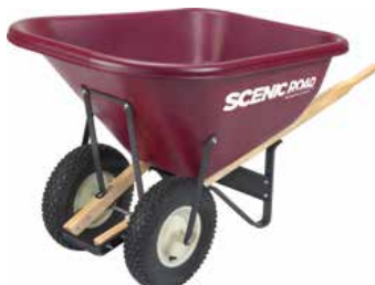
Model: M10-2K | Capacity: 10 cu.ft.