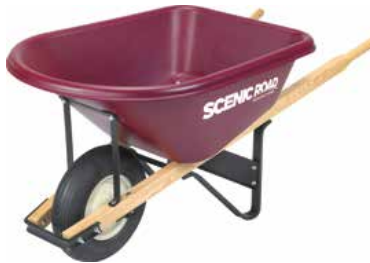
Model: M6-1R | Capacity: 6 cu.ft.