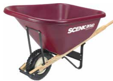
Model: M10-1FF | Capacity: 10 cu.ft.