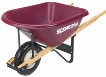
Model: M6-1FF | Capacity: 6 cu.ft.