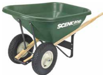
Model: G8-2K | Capacity: 8 cu.ft.