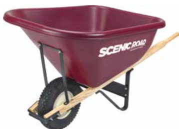
Model: M10-1K | Capacity: 10 cu.ft.