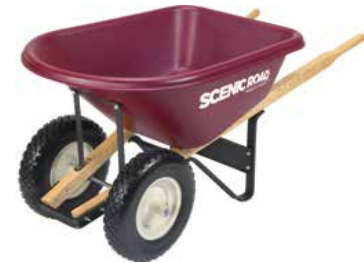
Model: M6-2FF | Capacity: 6 cu.ft.