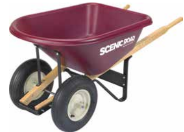
Model: M6-2R | Capacity: 6 cu.ft.