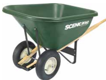
Model: G10-2R | Capacity: 10 cu.ft.