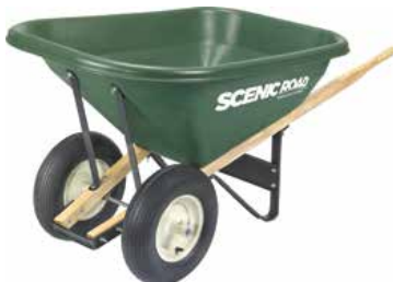
Model: G6-2R | Capacity: 6 cu.ft.