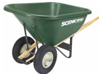
Model: G10-2K | Capacity: 10 cu.ft.