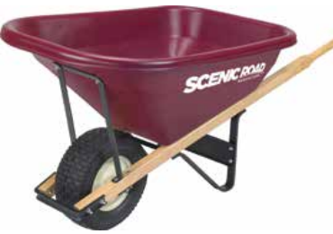
Model: M8-1T | Capacity: 8 cu.ft.