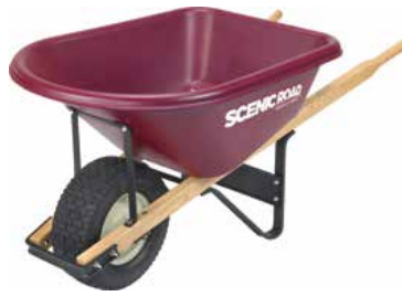
Model: M6-1T | Capacity: 6 cu.ft.