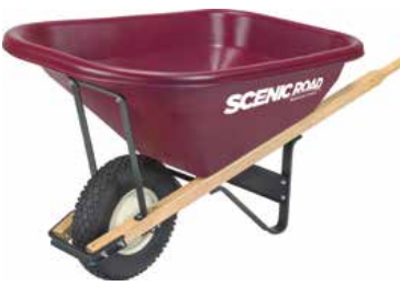
Model: M8-1K | Capacity: 8 cu.ft.