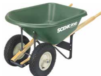
Model: G6-2K | Capacity: 6 cu.ft.