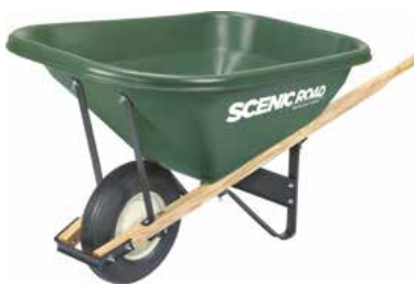
Model: G8-1K | Capacity: 8 cu.ft.