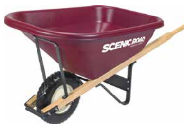
Model: M8-1FF | Capacity: 8 cu.ft.