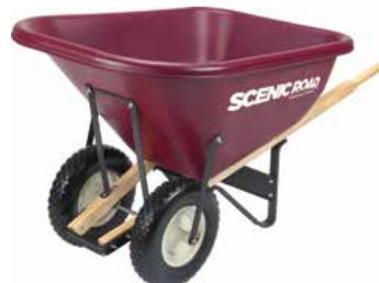
Model: M10-2FF | Capacity: 10 cu.ft.