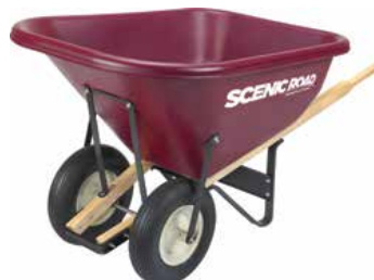
Model: M10-2R | Capacity: 10 cu.ft.