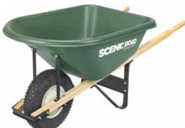
Model: G6-1K | Capacity: 6 cu.ft.